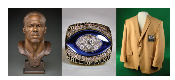
The Bronzed Bust, the Hall of Fame Ring of Excellence and the Gold Jacket represent the elite status of being members of the Pro Football Hall of Fame. The Gold Jacket is presented just prior to their enshrinement.