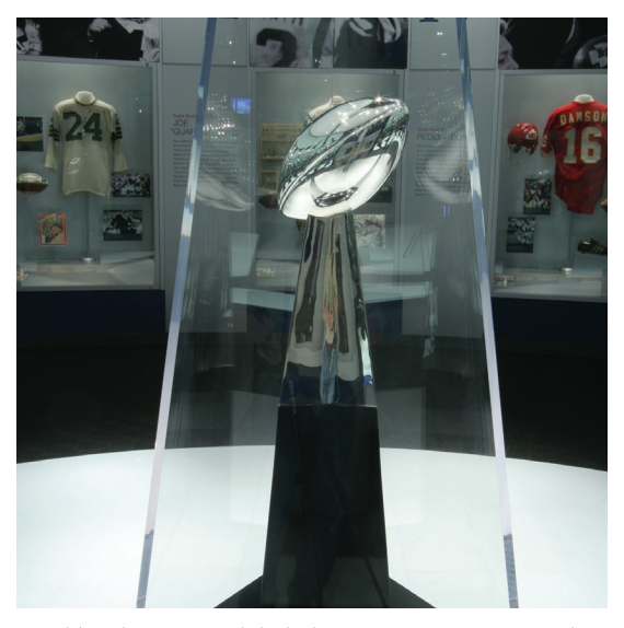
Bowl has become a global phenomenon. Super Bowl Theater, a turntable experience, presents the most recent NFL season and Super Bowl in spectacular fashion using the latest technology and the creative works of NFL Films.