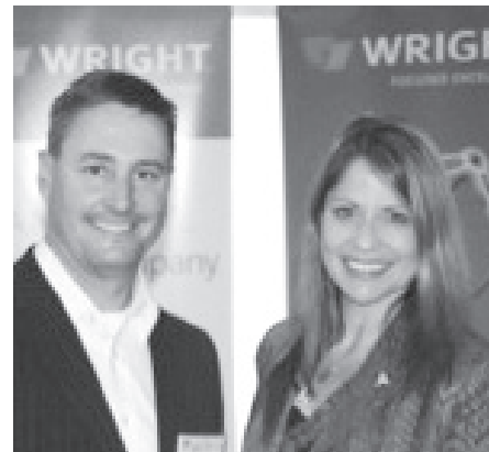
Wright Medical Technology Inc. 2014 Annual Gold Sponsor