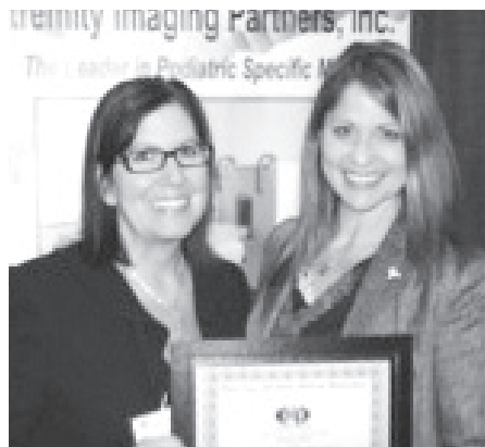
EIP OHFAMA Industry Affiliate