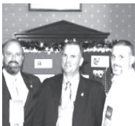
OPPAC Booth at The Annual