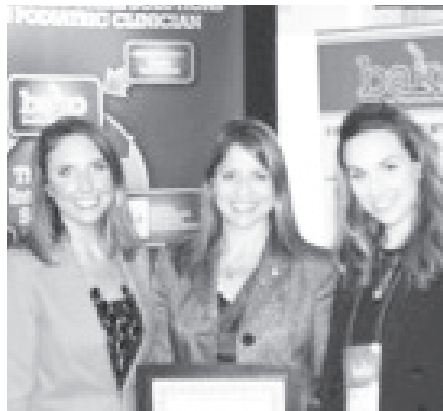
BAKO Integrated Physician Solution 2014 Annual Platinum Sponsor