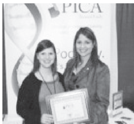
PICA 2014 Silver Sponsor and Reception Sponsor